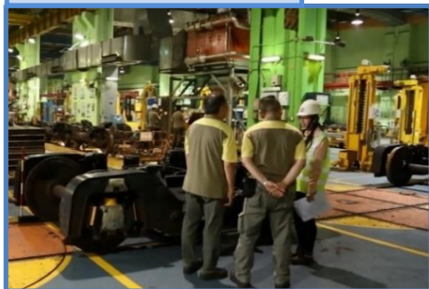
Railway incident investigation

The Railways Branch (“RB”) under EMSD is the regulatory authority on railway safety in Hong Kong. The RB regulates and monitors the safe operation of the railway systems operated by the MTRCL. The main functions of the RB include: