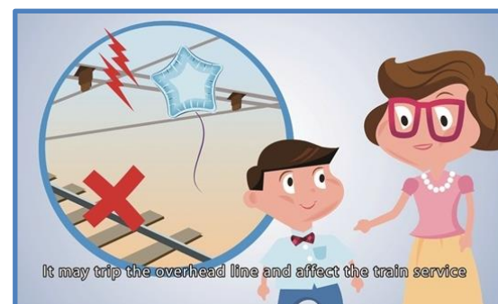
Publicity video for promoting railway safety

Apart from the above, the RB is also responsible for regulating and monitoring the safe operation of trams, the Peak Tramway and the Automated People Mover at the Hong Kong International Airport.