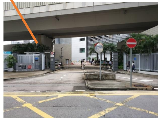
Vehicular and pedestrian entrance from Kai Shing Street