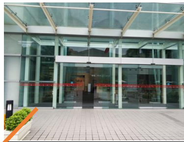
G/F Main Entrance to Lobby Area

Venue Address: EMSD HQs, 3 Kai Shing Street, Kowloon, Hong Kong